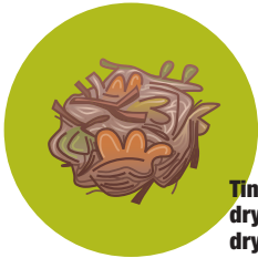
Tinder – small twigs, dry leaves or grass, dry needles.