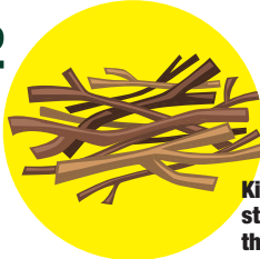
Kindling – dry sticks smaller than 1" around.