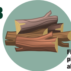
Firewood – larger, dry pieces of wood up to about 6-8" around.